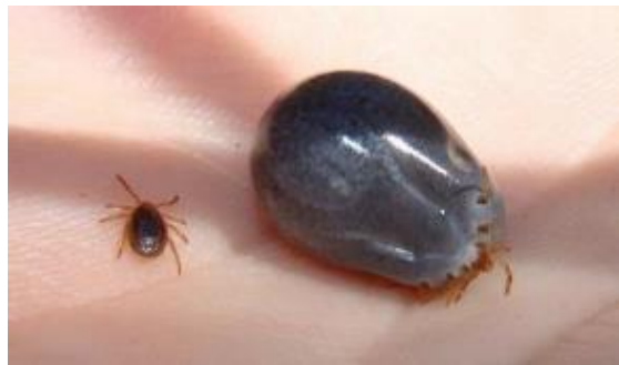
Figure 1: Female Australian paralysis tick before and after feeding (Public domain)

Public domain: Tørrissen, B. C. (2009) (CC BY 3.0)